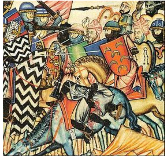
The Reconquista is a period of beginning in 711 AD Islamic conquest of the Iberian Peninsula until the fall of last Islamic State of Granada in 1492 to Ferdinand and Isabella, some 781 years. Reconquista completes just as Spain discovers of the New World and the era of the Portuguese and Spanish Empires..

Spanish exploration, the conquest of the Aztec and Inca empires, the subjugation of the indigenous natives, and colonization of the New World was the Golden Era of Spain called “Conquesta”. After Columbus returned from his first voyage, Spain’s newly establish absolute monarchy began financing the next voyages of Columbus’s and others bringing, the explorers, soldiers, and settlers who became the exporters of gold, silver and other goods from American and this, with the taxation of the new American commerce, brought wealth to the monarchs, strengthening their power and influence throughout the western world. The increased numbers